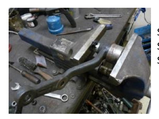
Step 1: Remove the idling arm assembly from the car.

Step 2: Remove the idling arm from the assembly.