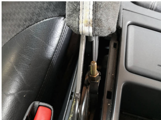
Now you can see the adjuster of the brake cable.