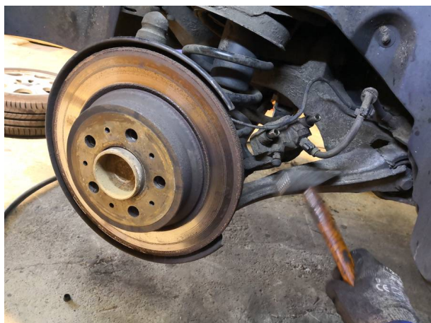
Now pull the brake discs from the wheel hub. If it is seized up, use a hammer on the back of the disc and turn the disc meanwhile.