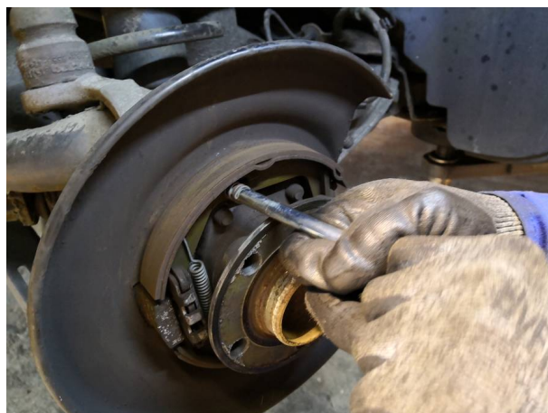
Now the handbrake is open. At first check the brake shoes lying against the counter bearings. If not, open the brake cable a few threads more. Sometimes the brake lever near the counter bearing is seized up, then you have to make it movable or exchange it. (1021782)