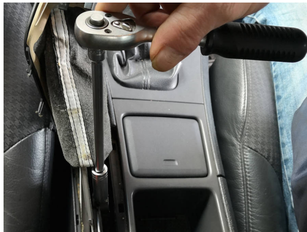
Unscrew the brake cable about 10 thread turns at the handbrake lever.